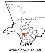
HIV & STD BURDEN BY INFECTION/ CO-INFECTION, 2010-2014