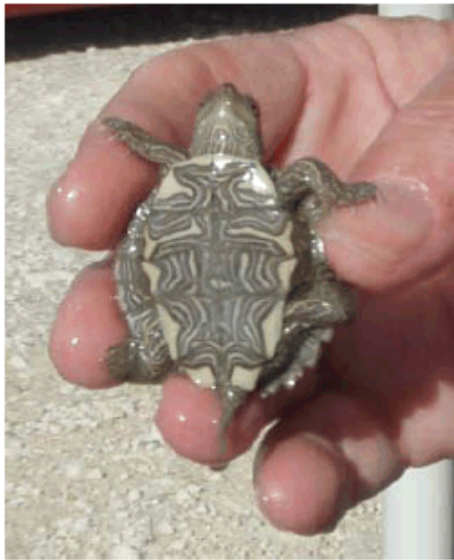
FIGURE 1. A small turtle with a carapace length of less than 4 inches